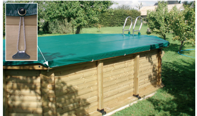
WDC for timber above ground pools