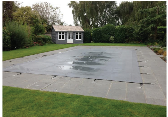
Grey WDC.