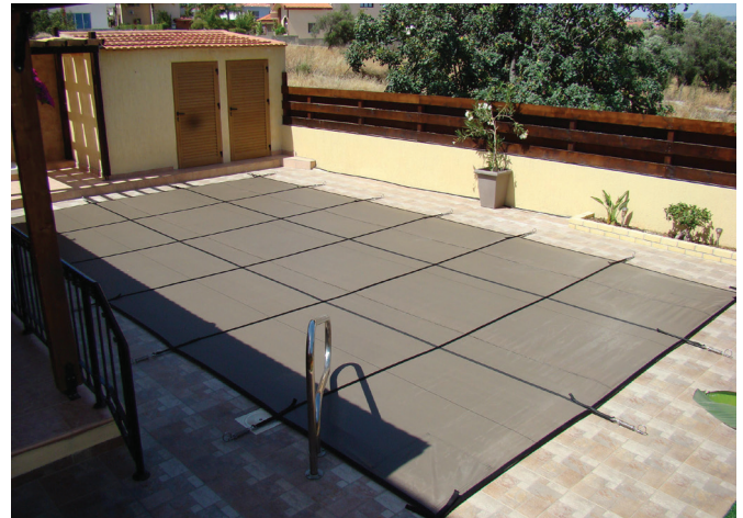
Tan WDC.