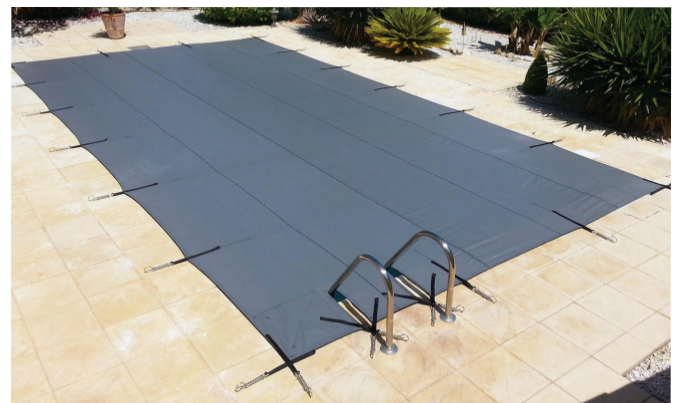
Grey WDC with ladder cut-out.