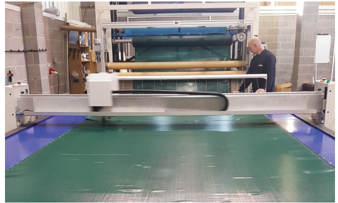
Certikin North's manufacturing equipment

However we can offer you a replacement cover at a very competitive price. Please contact the Liners and Covers department with your requirements.